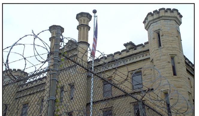
Lakeshore Public Media's 'Friends & Neighbors' series won a Telly for a segment on the old Joliet Prison.

Illinois ever since. When the Old Joliet Prison, as it's now known, fell into disrepair, the historical society stepped in. Their goal was to acknowledge the past and infamous